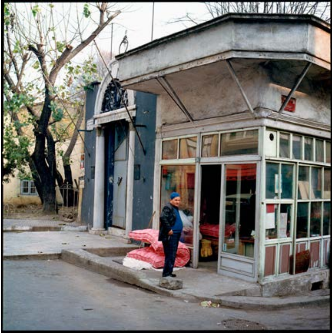
The synagogue of Ortakoy once allowed space for a Turkish mattress shop to be nestled next to its exterior wall. Security concerns have eliminated the shop and made gaining entrance to the synagogue more difficult.