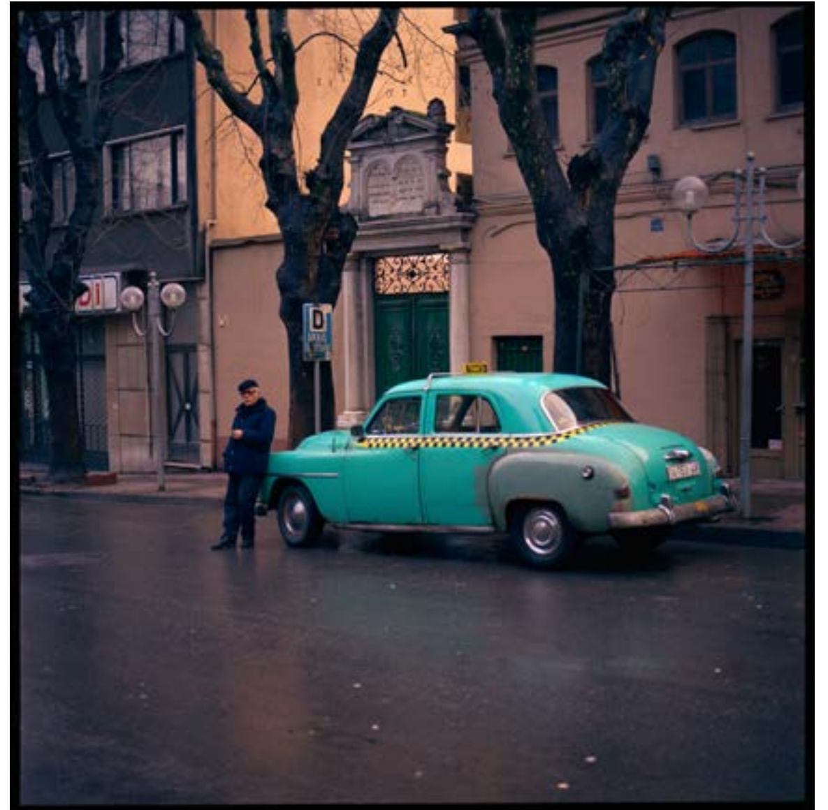
Dolmush a shared taxi-dolmush stop out of the lower synagogue of Kuzuncuk on the Asian side of the Bosphorus. The old style American cars in which up to 8 people stuffed themselves have been replaced by indispict mini vans and one of the vestiges of Isanbul's recent past is just that now.